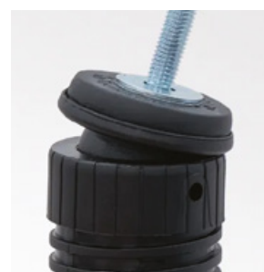
Adjustable angle 0-15°